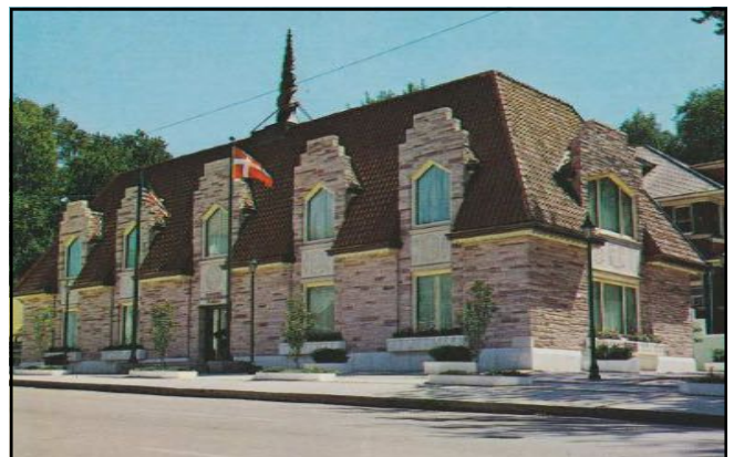
The former headquarters building of the Danish Brotherhood in America.

The building served as law offices from 1994 until 2015, when it was purchased by Security State Bank as future administrative space for Dundee Bank. AO, an Omaha architectural firm, is doing the architectural work on the property and hired Restoration Exchange to write the nomination. You can see the entire nomination document at: landmark.cityofomaha.org/images , then click on National Register. ■