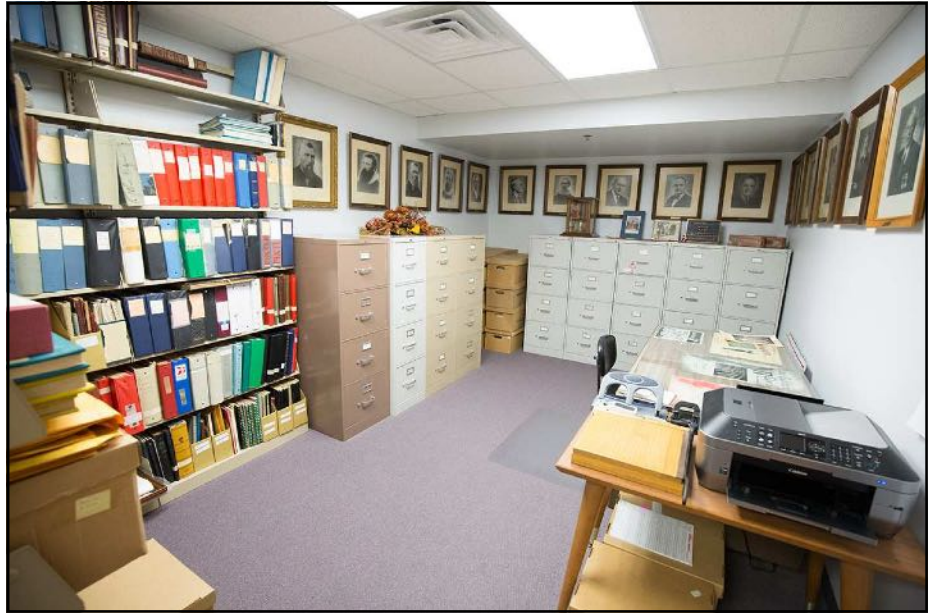
The Dana Room, located in the center of the DAAL, contains tens of thousands of documents. The goal is to eventually eliminate all the duplicates and digitize the collection.

While our efforts to make the most of our space by eliminating some materials seems to conflict with our desire to encourage the addition of more materials, it all goes to sharpen the focus of the DAAL in collecting and providing to the public the most complete picture of the Danish American experience. ■