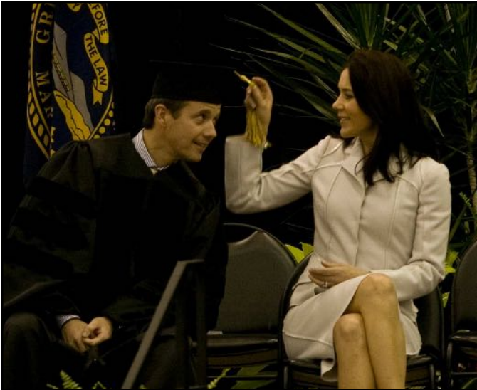
Crown Princess Mary helps Crown Prince Frederik with his tassel after he received an honorary doctorate of humane letters from Dana College.

On March 24, 2009, 33 years after his parents' visit and 70 years after his grandparents', Crown Prince Frederik, with his wife, Crown Princess Mary, spent an afternoon at Dana while on an eight-day tour of the U.S. As with the two earlier visits, they were accompanied by assistants, embassy staff members, Secret Service agents and Danish and American journalists.