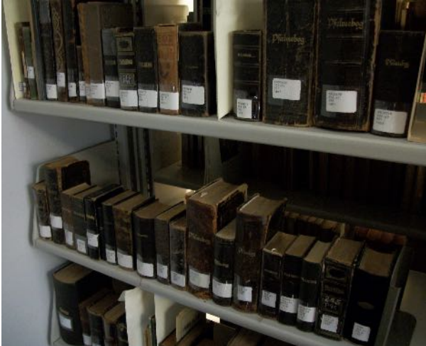
The Danish psalmebøger currently occupy one section of shelving on the library side of the DAAL.

When the Danish American Archive and Library moved into our present location, we brought along box after box of uncounted Danish language hymnals. Most of these were small (4" to 7" high) books published from the 1860's until the 1960's. Called psalmebøger or salmebøger in Danish, they were a ubiquitous part of every church-going Dane's life. Most families had more than one copy if not one for every member. They were from a couple hundred pages to more than a thousand depending on hymn supplements or appendices ( tillæg ). Some editions contain the readings for the Sundays of the church year and various liturgical services, and before World War I they were printed in the old Gothic script. They were published in Denmark by various publishing houses and in the United States they were distributed in large numbers by the Danish Lutheran Publishing House in Blair.