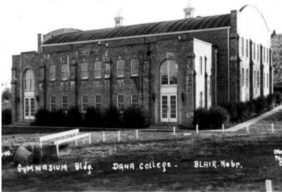
Alumni Memorial Auditorium circa 1940

-- An article in a December 1928 clipping from the Pilot that's headed, "Dana Gymnasium is Being Much