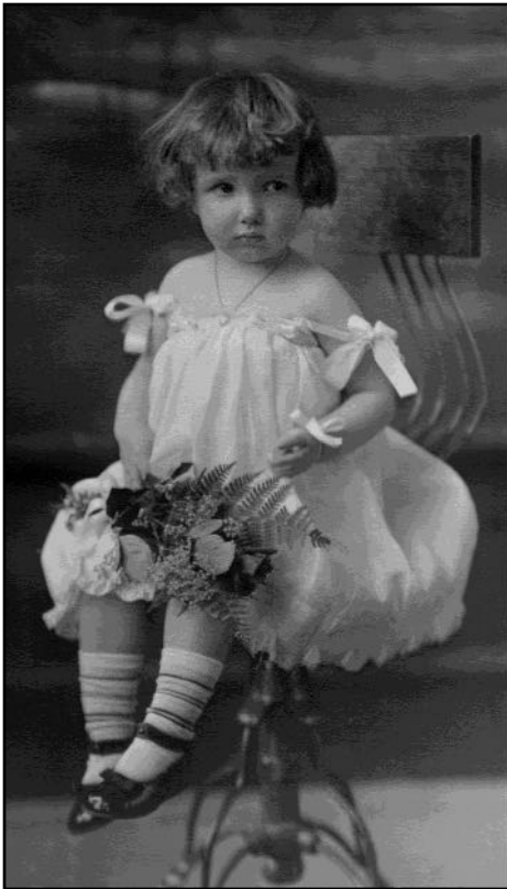
DANES GROWING UP AMERICAN

A publication of the Danish American Archive and Library January—April 2013