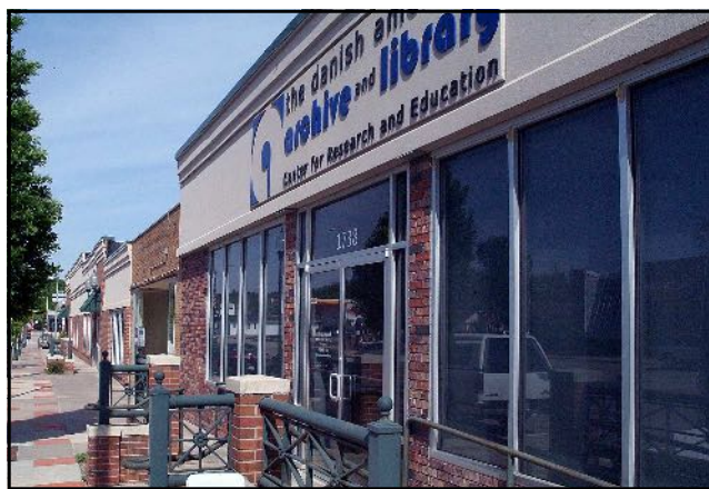
1738 Washington Street, Blair, Nebraska.

For now the staff and volunteers of the DAAL are happy to be at home in our own building! ■