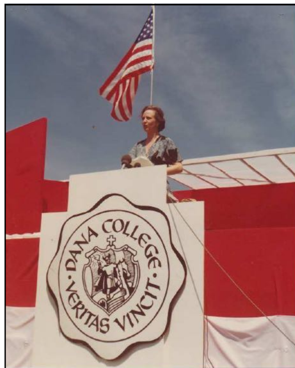
During a tour of the U.S., Queen Margrethe gave her only public address at Dana's Commencement.

And because she had anticipated seeing the Lauritz Melchior